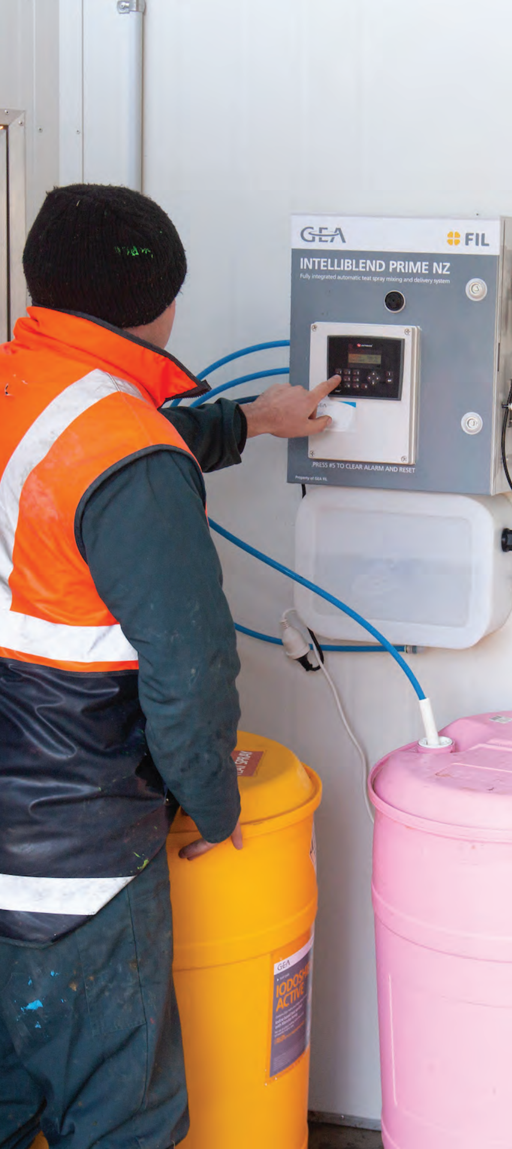
The FIL Intelliblend draws teat spray and emollient from the drum, accurately mixing 'ready to use' teat spray at set ratios of concentrate to water.